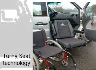
Turny Seat technology

Firstly, to enter and exit the Land Rover we will be using 'turny seat technology'. Kindly donated by Autoadapt the turny seat electronically pivots and lowers the driving