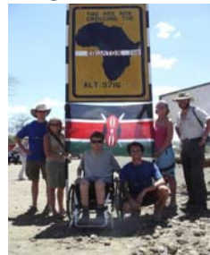
The team crossing the Equator