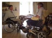
Inside a Quad house

to encourage independence and rehabilitation of quadriplegics, a service not offered by the state. One example are 'self help quad houses' where people with a SCI work together to share help, and transport.