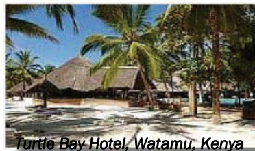
Turtle Bay Hotel, Watamu, Kenya

The date has been fixed; the caterers booked and plans are going ahead for the Hereford Dinner Dance. The historic Shirehall in the Centre of Hereford will be the venue for the ball; celebrated band Soul Sensation